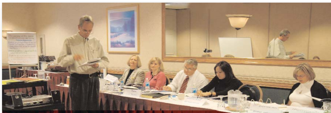
Leadership building in 2006: More than 200 key managers and supervisors learn about Alden's commitment to customer satisfaction through 'Leader Development for the 21st Century'

T he pivotal role leadership plays in a company's ability to grow and achieve its mission and vision is the basis for The ALDEN Network's 'Leader Development for the 21st Century' initiative.