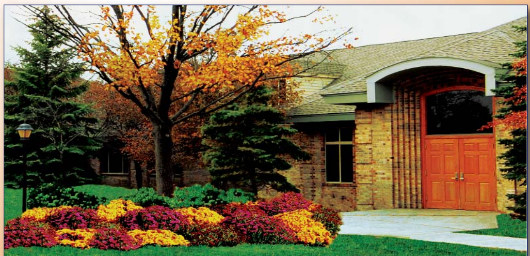
Alden Estates of Barrington debuts top-quality, post-hospital health care in an elegant environment

◆ Leadership skills are honed by Alden employees